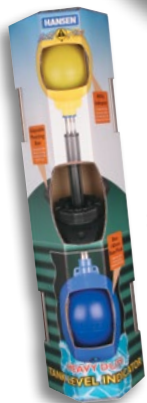
Packaged Store Box

NZ patent 596360 & registered design 415007 Australian patent 2012203010 & registered design 340061. Copyright 2011 Hansen Products NZ Ltd.