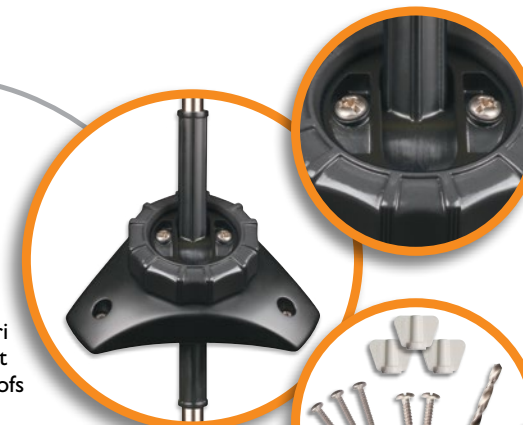
SECURITY LOCK SCREWS Screws lock the tubes into a vertical position preventing jamming in any weather conditions