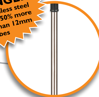
HEAVY DUTY STAINLESS STEEL TUBE 16mm Stainless Steel Tube for long life durability. Versatility of 3 Tubes allows for a tank fluid level reading of up to 2 metres (additional Tubes available for taller tanks).