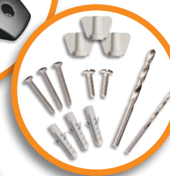
PLASTIC & CONCRETE TANK MOUNTING KITS Accessories supplied for mounting to both plastic and concrete tanks including screws, plugs, wing nuts and drill bits