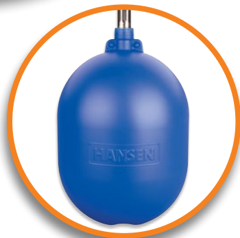
LONG BOTTOM FLOAT 155 x 230mm long bottom float ensures excellent buoyancy for accurate indication of fluid level